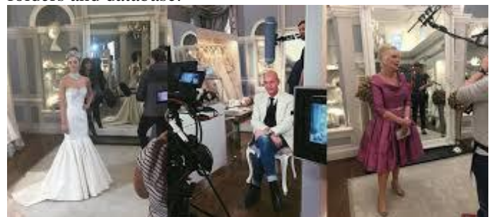
Posh Frock Shop scenes

In 2013 Pete and Ian decided to open a flagship outlet in Blewcoat in Westminster. This is an historic school building on Buckingham Gate near the palace. The whole building was re-modelled to best capture the glam and splendour of a wedding ceremony. My role was to make sure the computers at Blewcoat became integrated with servers back in West Norwood – which I accomplished with VPN (virtual private network) connections. In effect, staff could log on at either building and see the same shared folders and database.