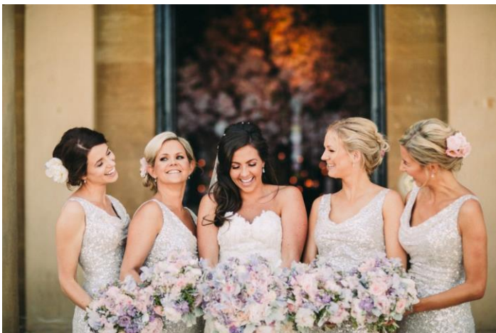
Selection of Ian Stuart wedding dresses