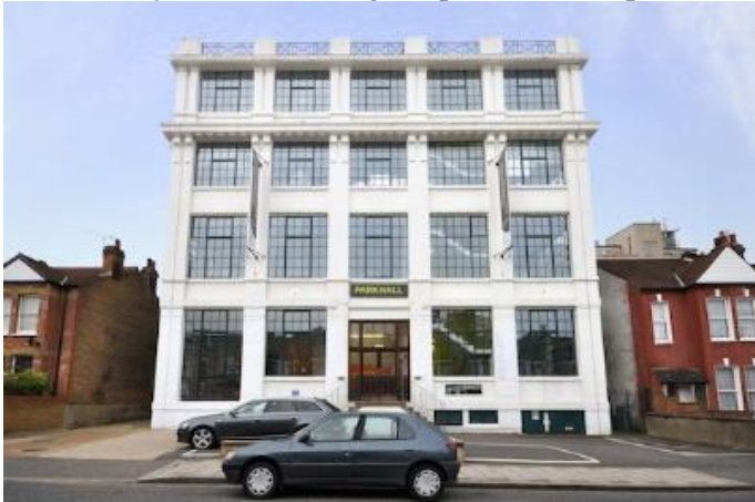
Park Hall Industrial Estate – West Norwood

From 2002, I owned and operated a small computer network business in South London. Our customers were primary schools. Tony Blair's government had recently installed networks in most primary schools but there were few people who could show teachers how to use them. As a teacher myself, I was in a good position to help.