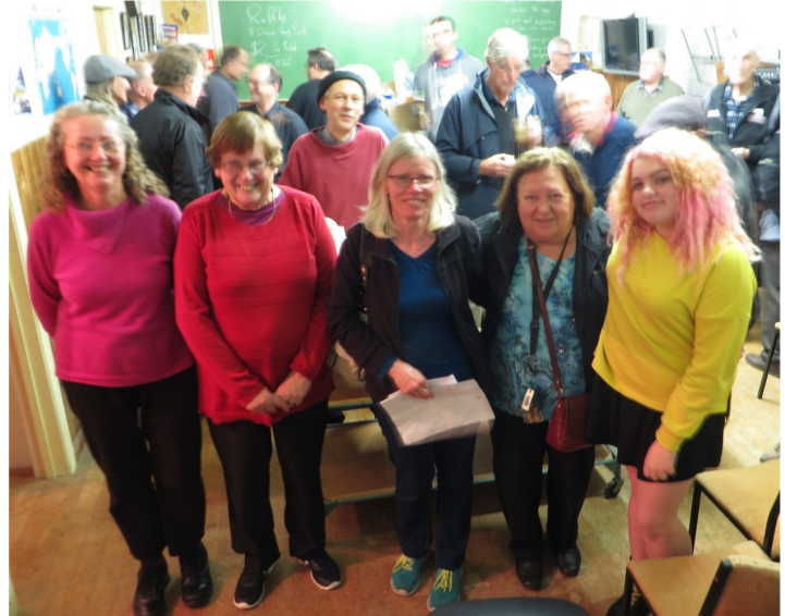
Below: YLs pictured during supper.