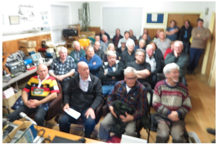
Above: At the sale.

The sale was well attended, with all seats occupied. Purchasers came from as far north as Whangaparoa, and as far south as Wellington.