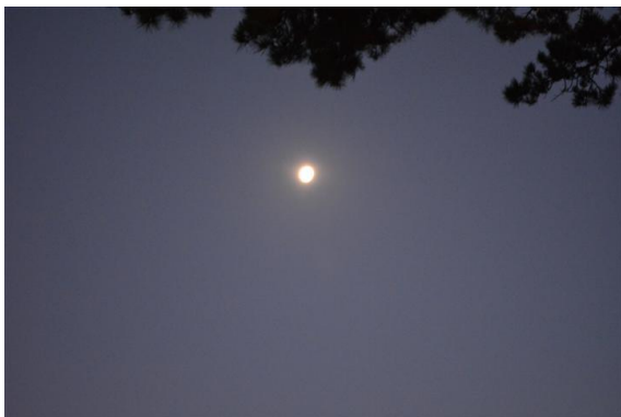
The full moon assisted night operations