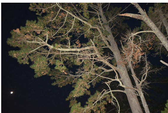
Plenty of shade during the hot part of the day.