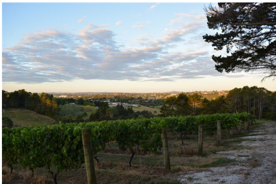
Looking towards Auckland Central from the field day site.