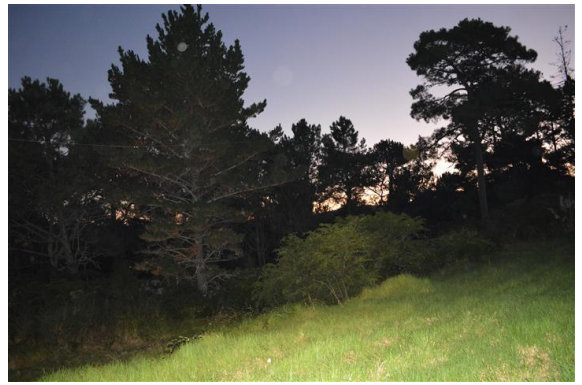
The 80-metre dipole is in there somewhere!