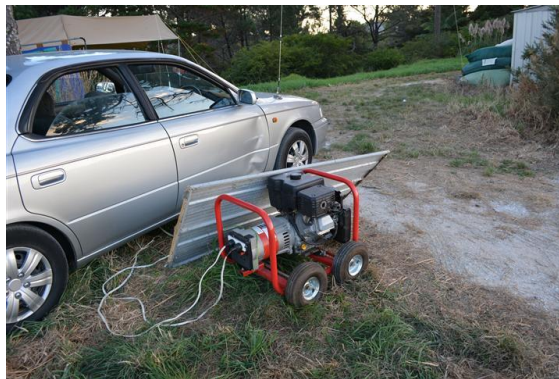
The generator used for 40-metres.