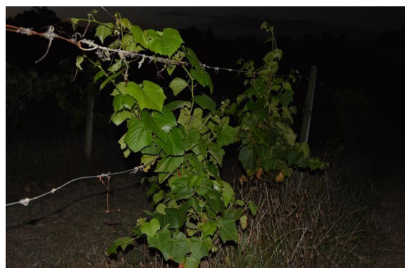
I think the birds beat us to the grapes on this vine!