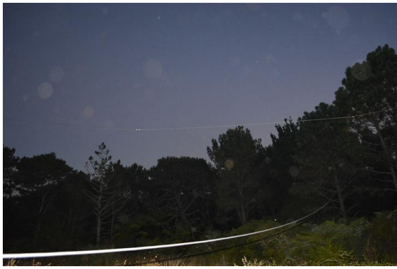
You may just be able to make out the 40-metre dipole just above the top of the trees (centre vertical). The big white line starting bottom-left is the coax.