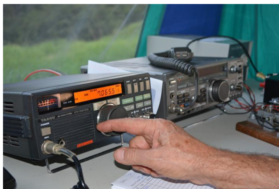
Searching for a Station on 40-metres.