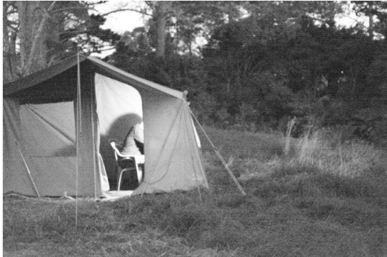
The 40-metre tent at night.