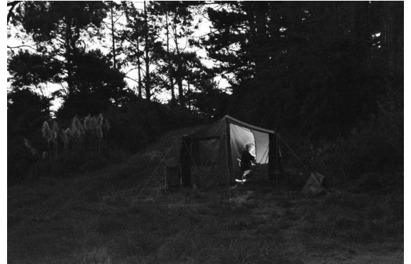
The 80-metre tent at night.