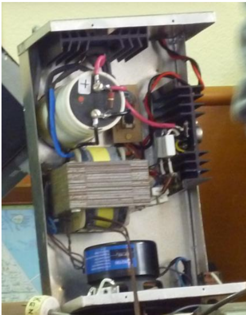
General View of the Power Supply