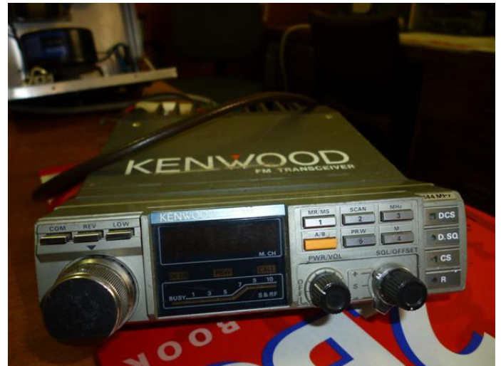
The 2-Metre Radio