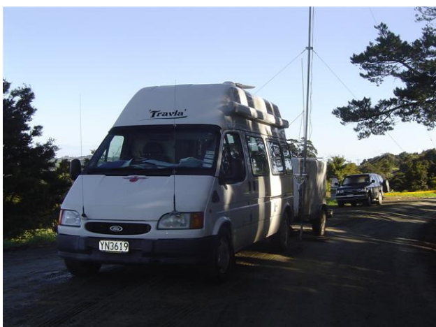
Ready for the Rally Cars