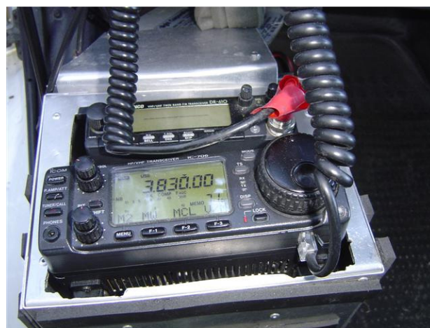
The Radio Equipment