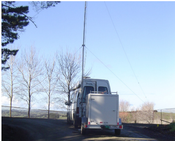
Van and Trailer