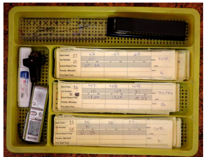
Time Sheets in the Utensil Tray