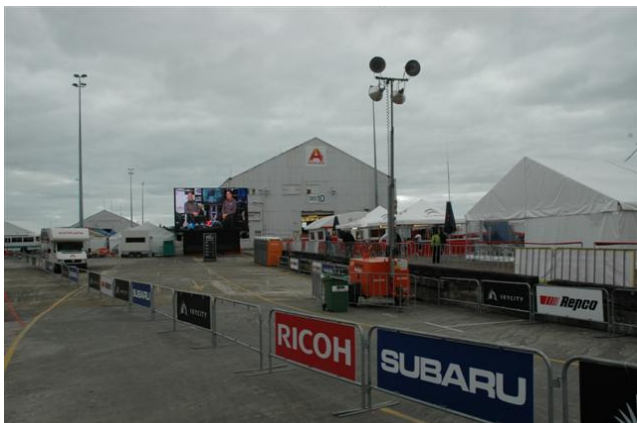
Service Park H