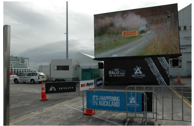
Service Park E