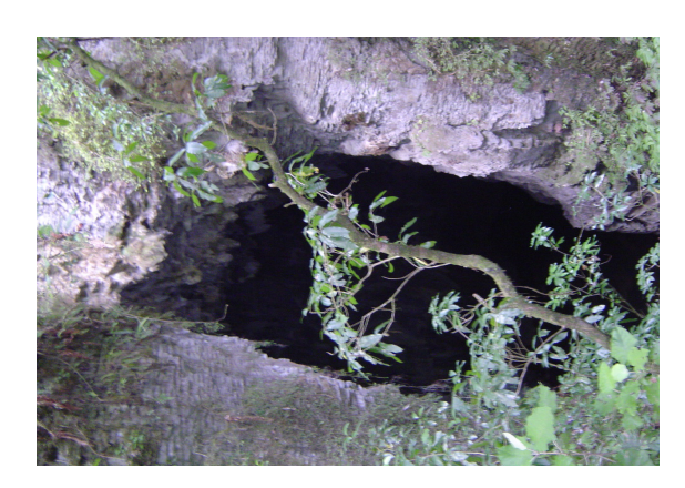
Waitomo looking down black water hole