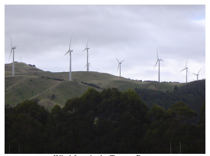
Wind farm in the Tararua Range