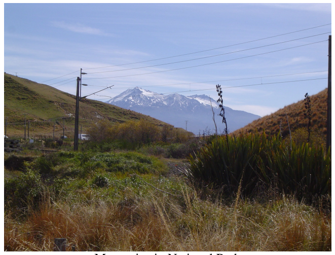
Mountains in National Park