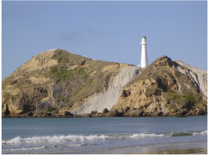
Castle point Lighthouse from beach

It was an early start next morning as we travelled north though the forest and by passing Hamilton due to the V8 street race to come out at Taupiri and joining Highway 1 to Auckland arriving home just in time for lunch, unpacking and clearing out the van and trailer. We Covered some 1550 kilometres filling with diesel only four times. No Problems and the trailer towed well behind the van.