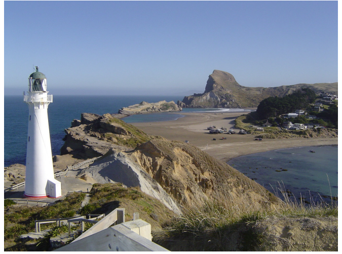
Looking from Lighthouse. into the boat harbour