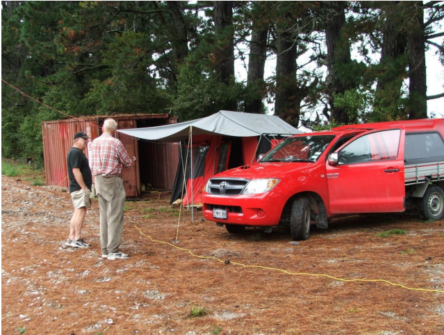
The 80 metre QRP station tent