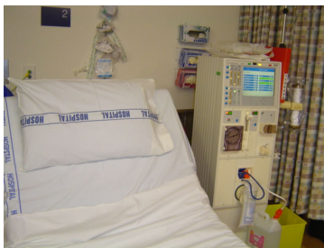
Machine next to bed Hemo Dialysis

This was followed by Ross ZL1VRR who gave a talk on dialysis and what he has to do each day, four times a day and seven days a week fifty-two weeks of the year. Firstly he told those present to look after your kidneys watching what you eat and drink. The kidneys have many functions other than to get rid of fluid waste by urinating. They produce calcium for your bones and allow extra oxygen produced to drive the muscles in your arms and legs. If your kidneys fail then you have two options, to go onto dialysis either PDU using glucose solution bags to draw the waste from your blood through your perennal cavity which is a membrane which collects the fluid that is then drained out into a collector bag, or go to a hospital or clinic and have a machine that filters your blood for 4 /5 hours each visit three times a week. This can also be done at your home with a machine been lent from the hospital at many thousands of dollars.