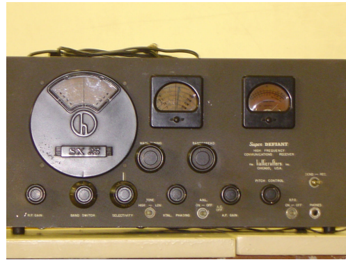
World War 2 transceiver found on a war site.

Next was Tom ZL1CZ who gave his talk on a folded dipole using a metal coat hanger to show what could be accomplished using different configurations He explained by moving your feed point around gave different aspects of the dipole when feed from the top, side or bottom.