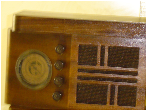
Barry's early Radios Receivers valve type