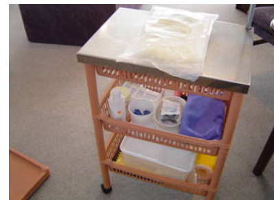
Layout with bag on trolley at home