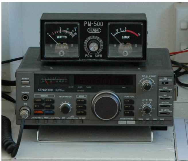
Kenwood TS 6805 and SWR Bridge