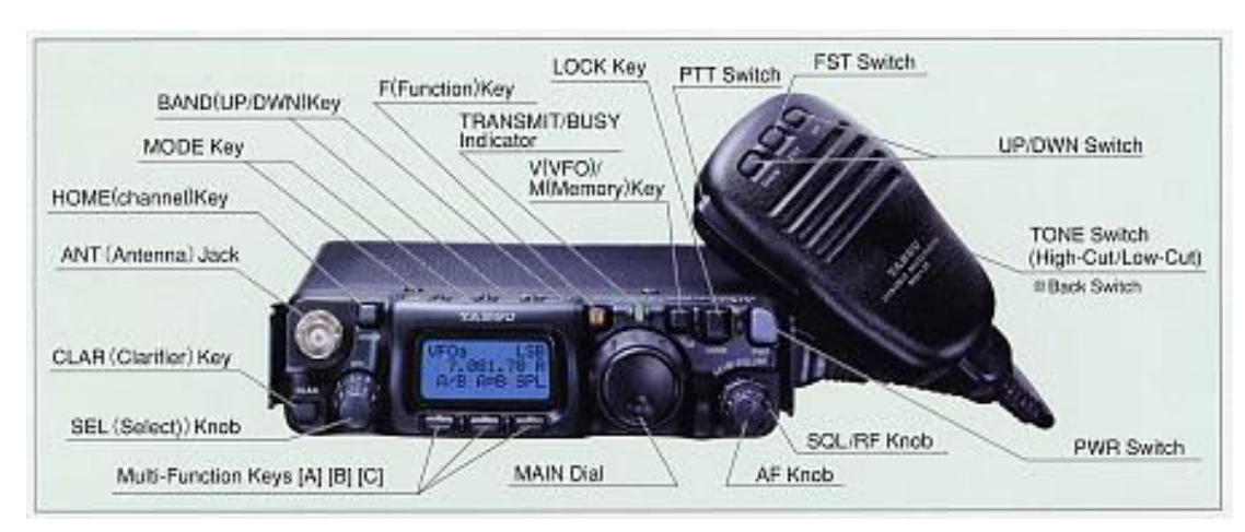
FT817 For those interested ED