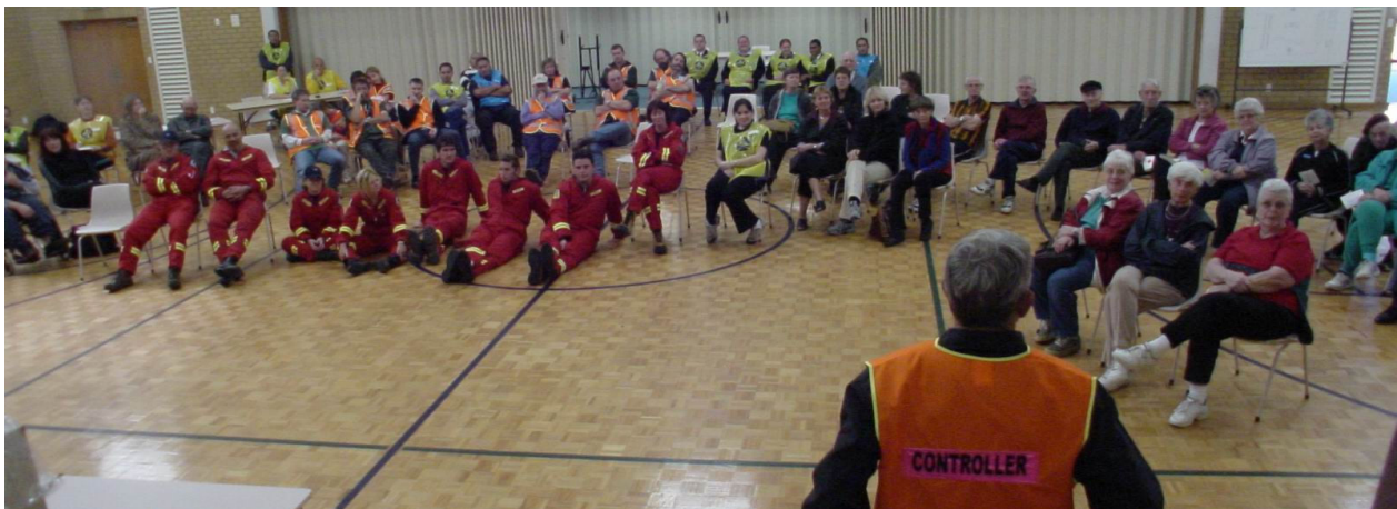
The Group of People involved in the Civil Defense Exercise at the Debriefing

Western Suburbs Radio Club Branch 03, N.Z.A.R.T. Inc: Minutes of the 3 rd meeting of the 2004 elected Committee. Monday 17 th : 2004. (Edited)