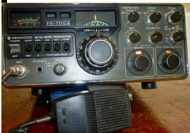
Kenwood TS700A VHF all mode