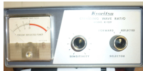
Kyoritsu K109 SWR meter