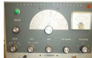
Heathkit Model IG42 Laboratory Generator No output

The complete list is posted on the notice board.