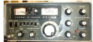
Yaesu FT101E has AC mains