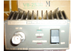
Kenwood VB2530 2m Power amp.