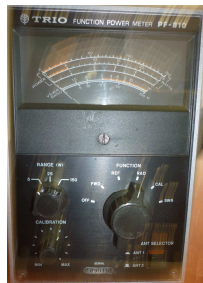
Trio PF810 Function power meter 1.8 MHz to 200 MHz