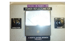
Power reflectometer A Branch 29 project 2 ranges (100w max)