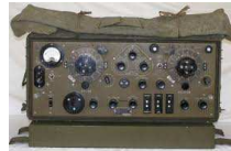
ZL1 Mark II