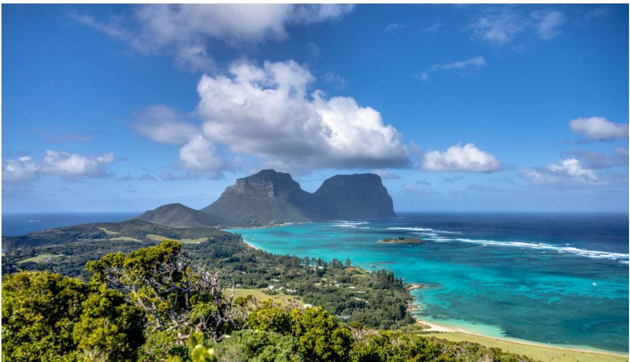
Lord Howe Island.