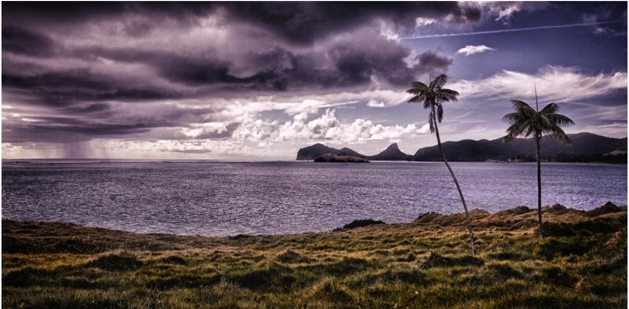
Sunset, Lovers Bay, Lord Howe Island.