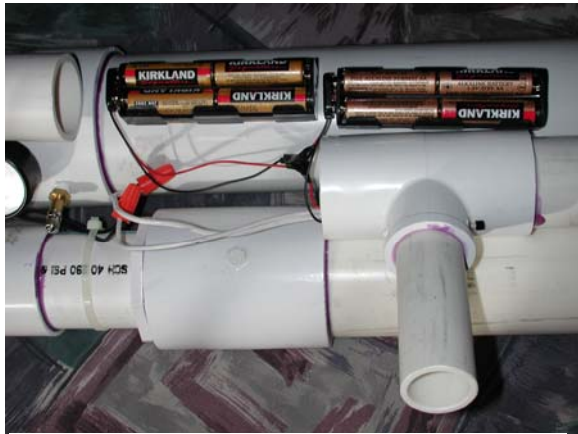
Electrical wiring and batteries