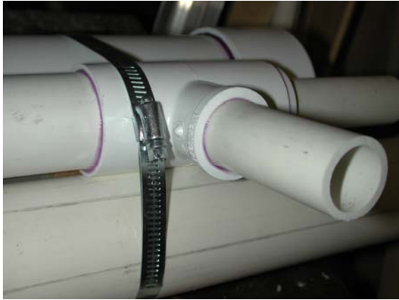
Front handle and main clamp.