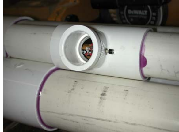
Inside the trigger switch handle.

matic. Finally, the Pneumatic Launcher offers significantly more performance than either the slingshot or bow. It does not require as much strength or skill to operate, though one must be strong enough to hold it when launching, as the model described here weighs about ten pounds. The pneumatic launcher is somewhat slower to deploy for a launch than the slingshot or bow, but the increased performance and higher success rate may more than compensate. Due to the low cost and ease of use it is also possible to have several launchers available so these activities may be occurring in parallel, and augmenting the slingshot (and possibly the bow) with the pneumatic works out well - use the slingshot where it reaches, and the archery or pneumatic for the tougher paths. The additional performance may be useful to reduce the required time in some cases, as when launching an inverted L antenna in one shot as described in the example above, instead of the two it would usually take (one for each support point).