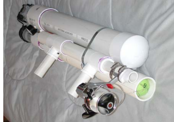
Fishing reel and tennis ball in the barrel.

planned it quite that way, expecting to just overshoot the first tree, but I apparently had set the pressure a bit higher than required. The result was excellent - it did the whole inverted L wire path in one go, and the weighted tennis ball came down on its own with no fuss, so no time was wasted there.