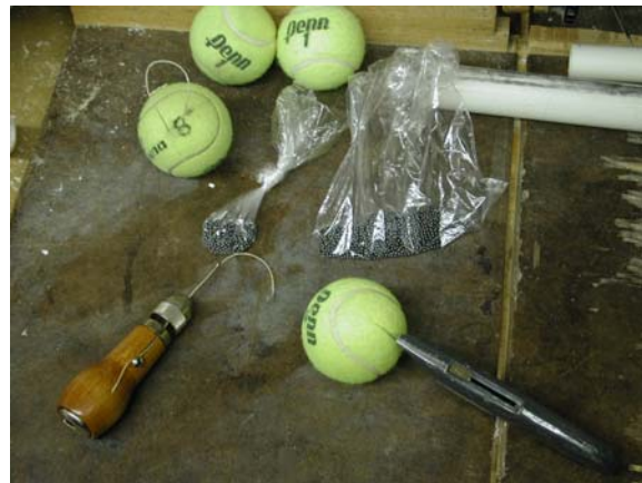
Tennis balls, tools and weights.