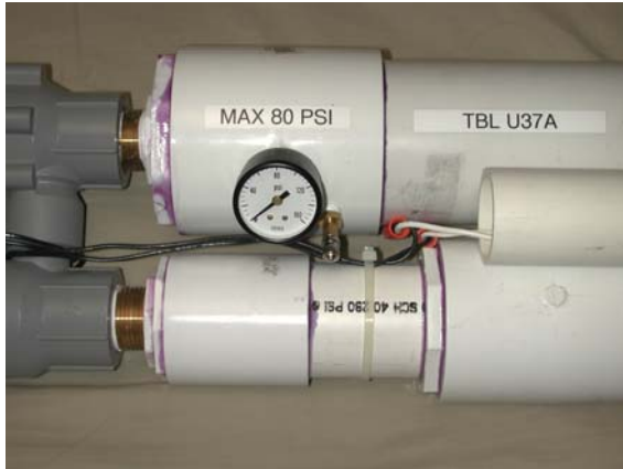
Sprinkler valve, pressure gauge, fill valve.

difficulty is in getting the weight to pull the line down once it has touched the foliage. If the tree is dry, or the branch is dead and dry, it works well. Some of the time (such as Field Day 2002), the weight won't come down.