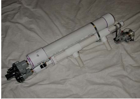
Overall view: note the electric sprinkler valve on the left.