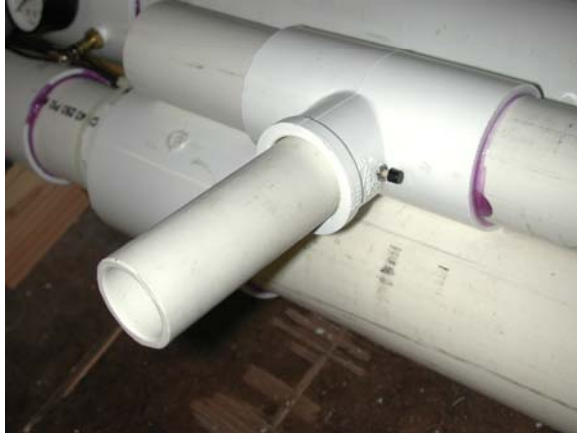
Rear handle with trigger switch

(except the fishing reel and line) for about fifty bucks, and build the system in a few evenings.