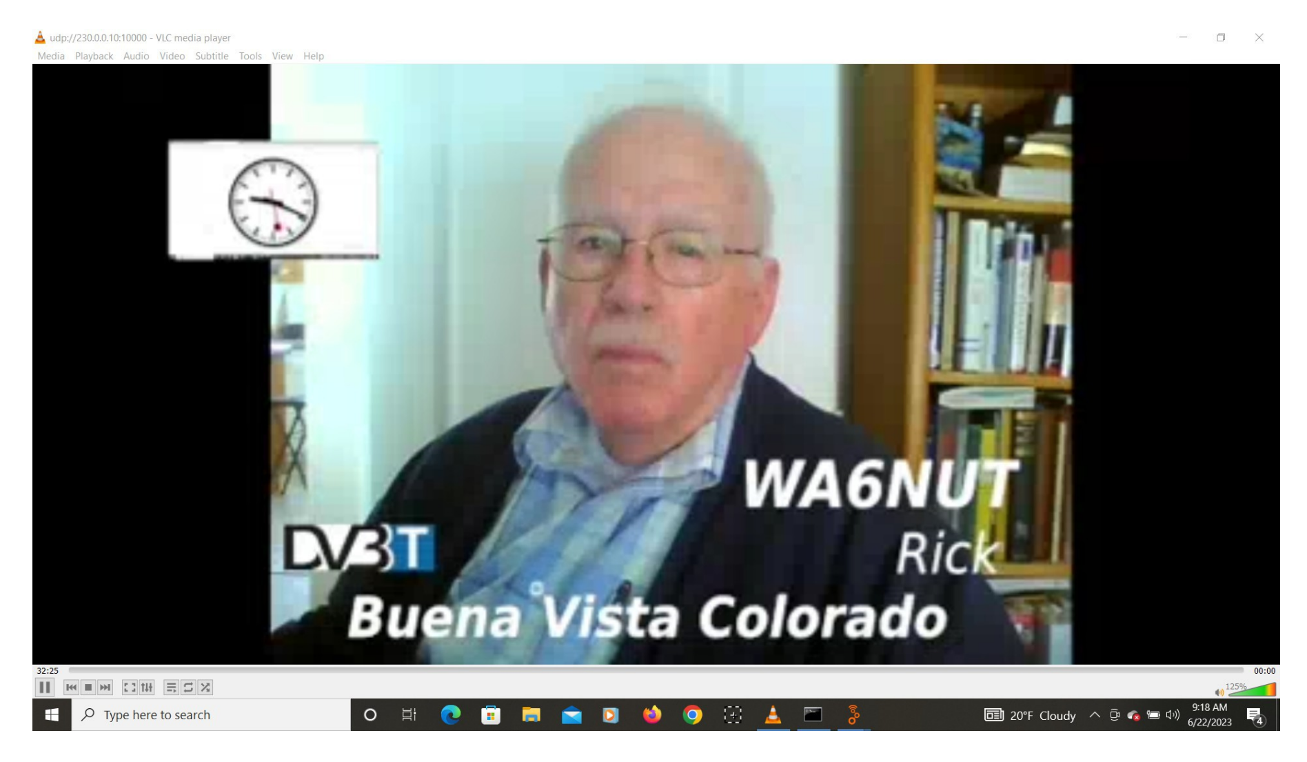
Figure 2: Receiving PC screenshot: Showing the received image on VLC Media Player. The HB9DUG/G4NZV GNURadio DVB-T receiver is shown in Figure 3.