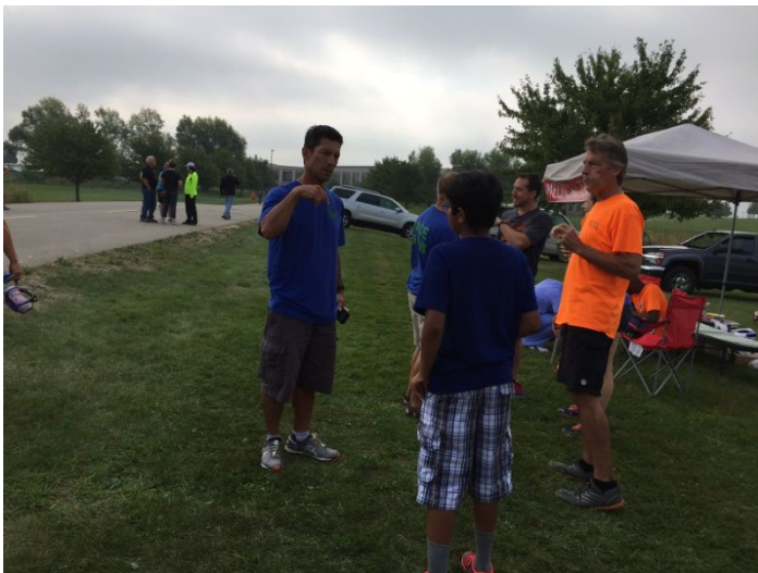
Some pictures of the participants at the half marathon.