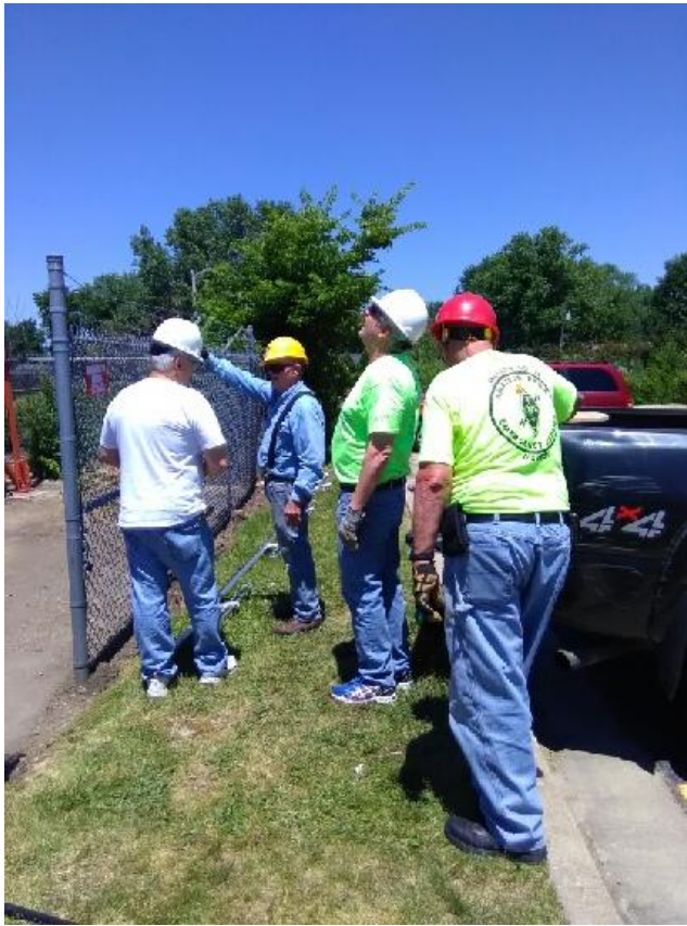
The ground crew waiting for the next job.