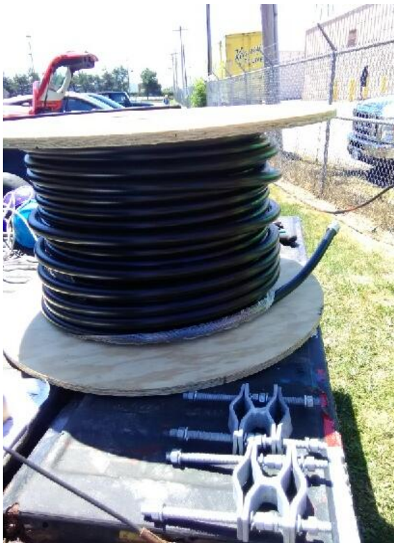
The spool of hard line and antenna stand-offs.