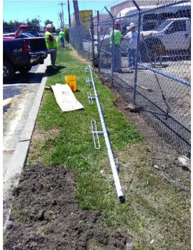
The new antenna. Note the gardening work we did to the site.