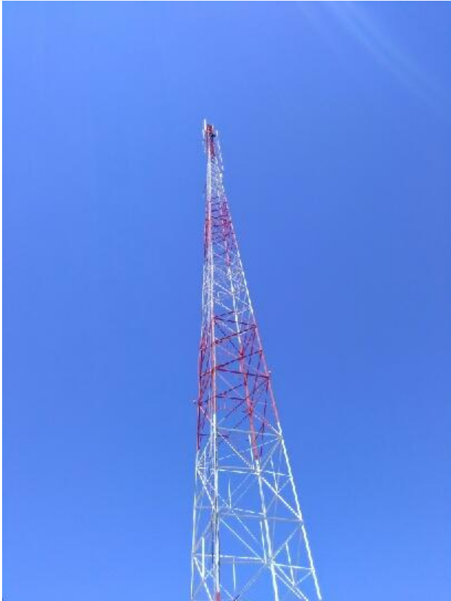
He doesn't look so tall from here