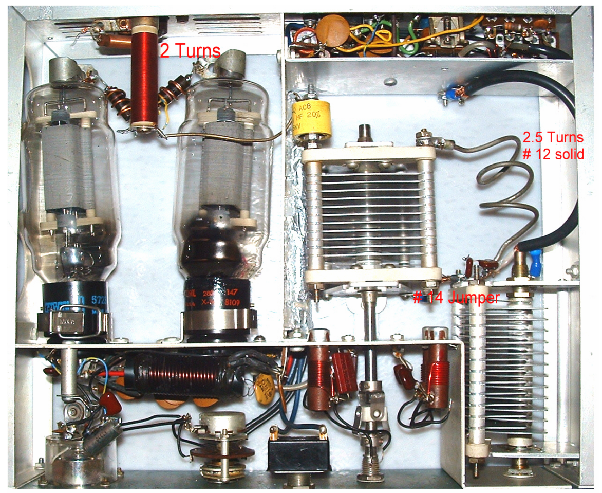
Figure 7 Completed Modifications

or less at some frequency on or near 6 meters. If the frequency is too high, compress the coil turns until the lowest SWR is at 50.1 MHZ; conversely spread the turns if the frequency is too low. If the minimum SWR is not less than 1.5:1, then you will have to add or subtract the capacitance of the two input capacitors. I suggest small changes of 10 PF to one of the other. Sweep the frequency again and see if the match is better or worse. This is a trial and error sort of thing that can take a while. Be patient! It may be possible to adjust the input circuit without an SWR analyzer but it would take the patience of a saint and a lot of luck of the Irish to get it right; trust me, I tried it and failed