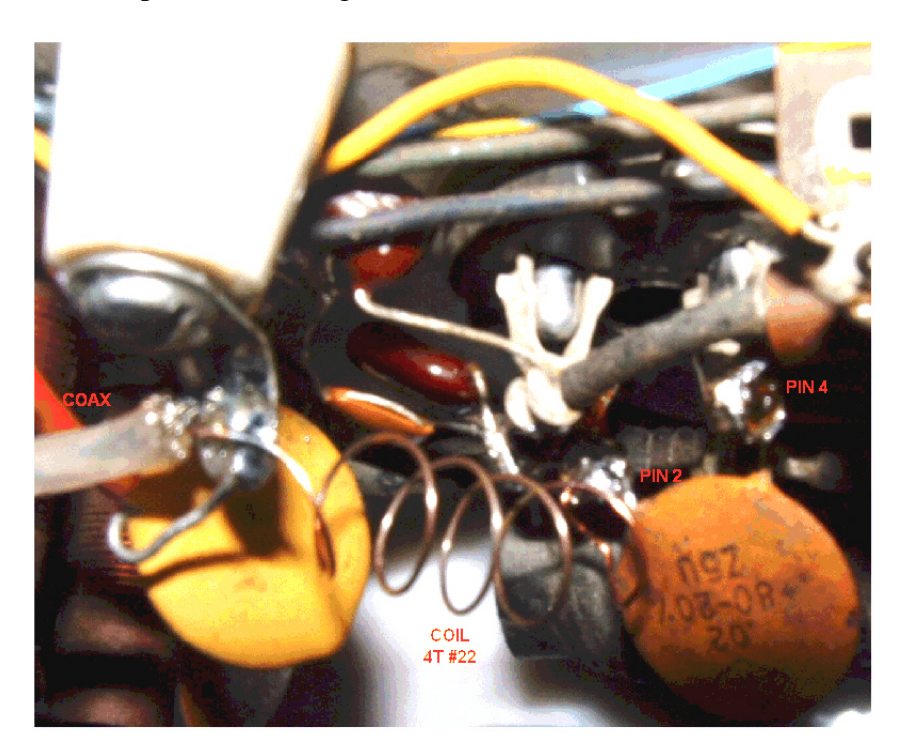
Figure 4 Input Circuit

The electrical modifications are simple compared to the physical modifications. The input circuit needs two fixed capacitors and a single coil space wound with #20 solid wire at \frac{1}{2} " diameter. The coil is mounted between the insulator that used to hold the plate blocking capacitor (C-14) and pin 2 of the nearest 572B tubes. Pin 2 is unused and it has a wire that used to connect to the band switch that should be removed (See Note 7 on the schematic, pin 2 also connects to the 140 PF capacitor and C-13). The coax that also used to connect to the band switch now connects to the insulator along with the coil and the 140 PF silver mica capacitor. (See Figure 4.0 and Note 6 on the Schematic)