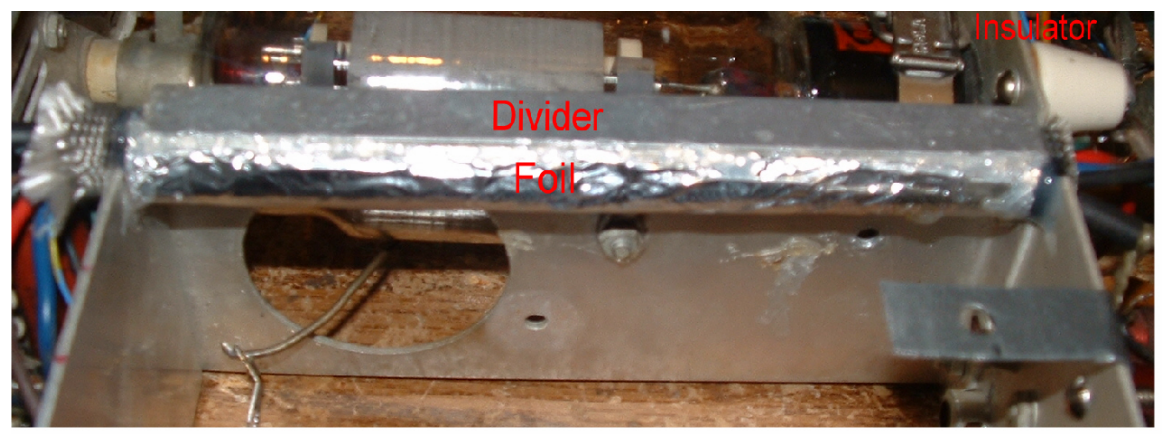
Figure 2.0 Foil Shielding

While the PI network area is open, it is easy to install some of the additional shielding. I put this in to reduce the effect of the pilot light glowing brighter when transmitting but its not a bad idea for added stability. The cable bundle inside a cloth sheath that runs from the rear of the amplifier to the front along the divider between the tube and PI areas will be covered with aluminum foil (See Figures 2 & 3). Installing the foil shield takes a bit of