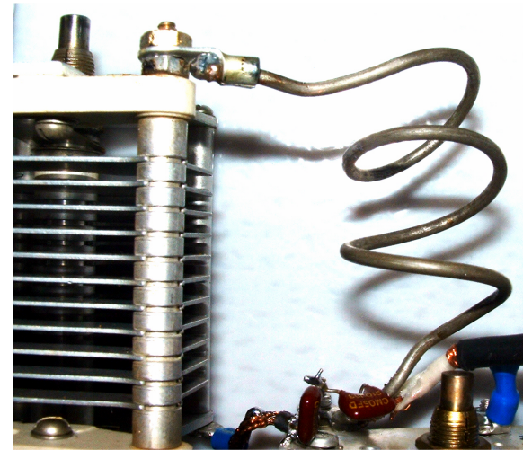
Figure 6 PI Network Coil

Finally, disconnect C-9 from pin 3 of V-1 (See Note 2 of the Schematic).