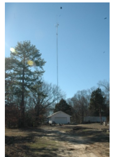
C.A.R.A. 145.370 Repeater