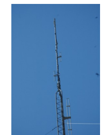
C.A.R.A. 147.225 PL 107.2 Repeater