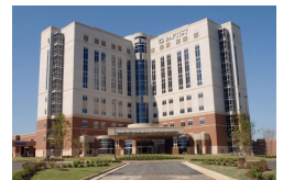
C.A.R.A. 145.350 PL 107.2 Repeater