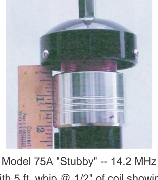
with 5 ft. whip @ 1/2" of coil showing