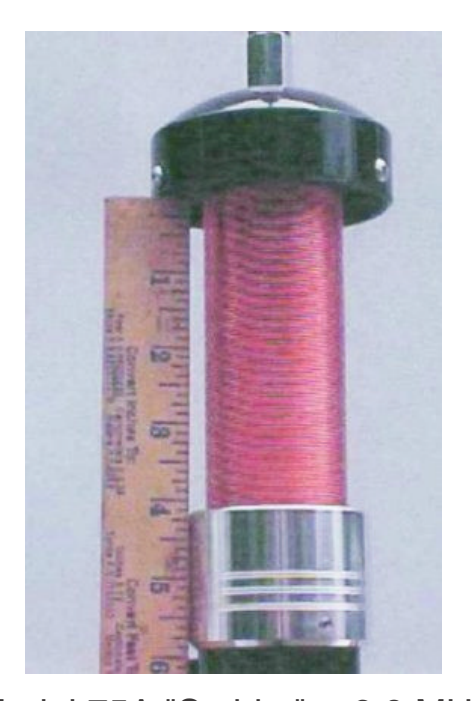
Model 75A "Stubby" -- 3.9 MHz with 5 ft. whip @ 4" of coil showing