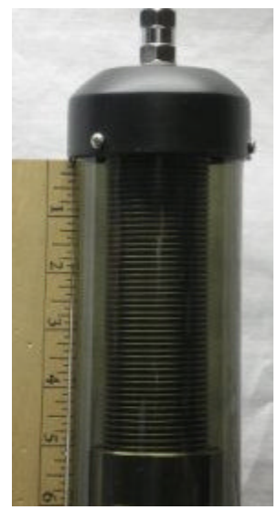
Model 200A-HP -- 7.1 MHz with 5 ft. whip @ 5" of coil showing