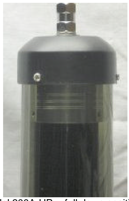
Model 200A-HP -- full down position with 5 ft. whip -- 29.0 MHz

The following photos will show you relative tuning positions of the Model 200A-HP Tarheel Antennas.