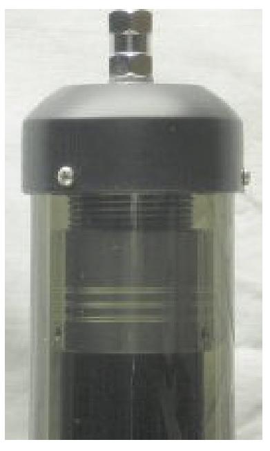
Model 200A-HP -- 21.2 MHz with 5 ft. whip @ 1/2" of coil showing