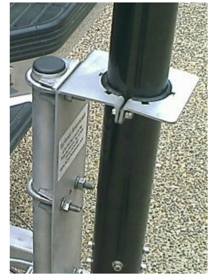
Don't forget to tighten down the top half plate and the quick disconnect. (Pictures 9 & 10)