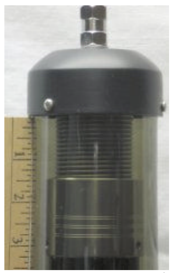
Model 200A-HP --14.2 MHz with 5 ft. whip @ 1 1/2" of coil showing