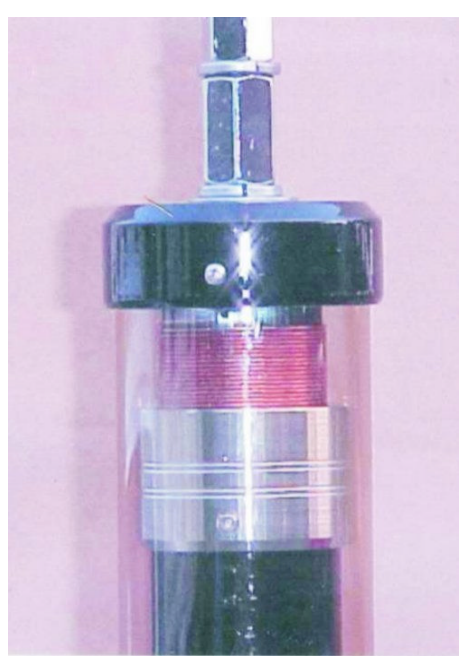
Little Tarheel II in 20 meter position with 32" whip