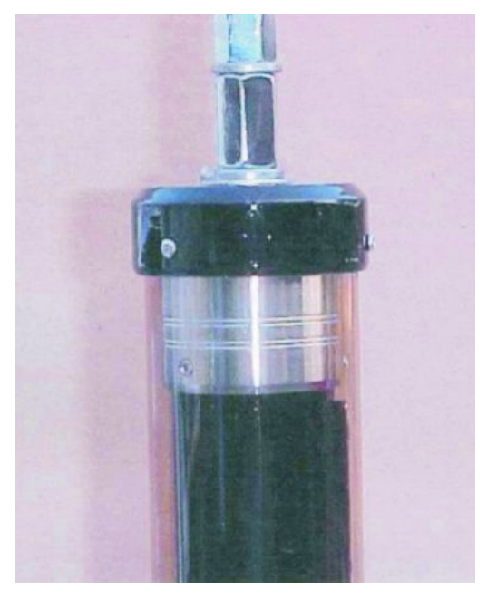
Little Tarheel II in 6 meter position with 32" whip

The following photos will show you relative tuning positions of the Little Tarheel II antenna.