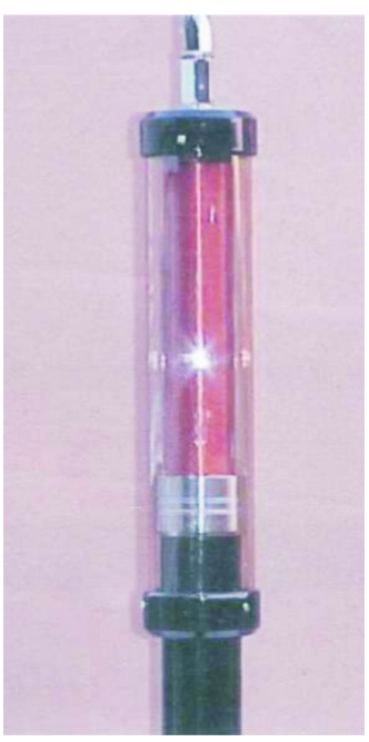
Little Tarheel II in 80 meter position with 32" whip