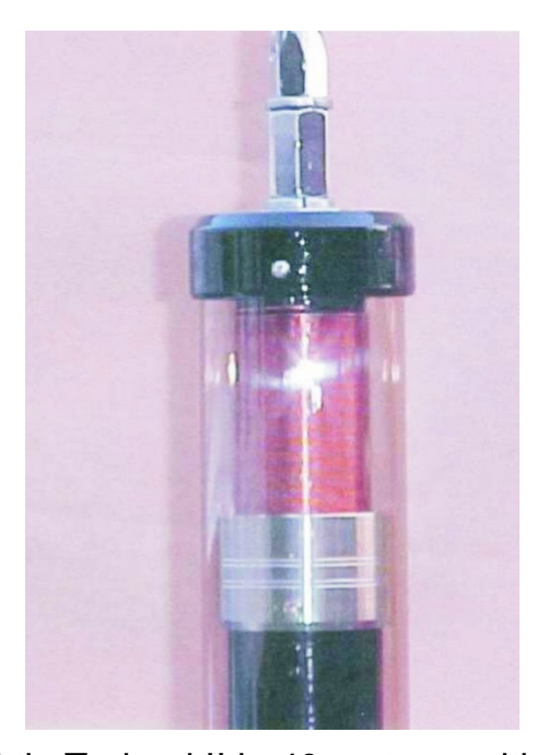
Little Tarheel II in 40 meter position with 32" whip