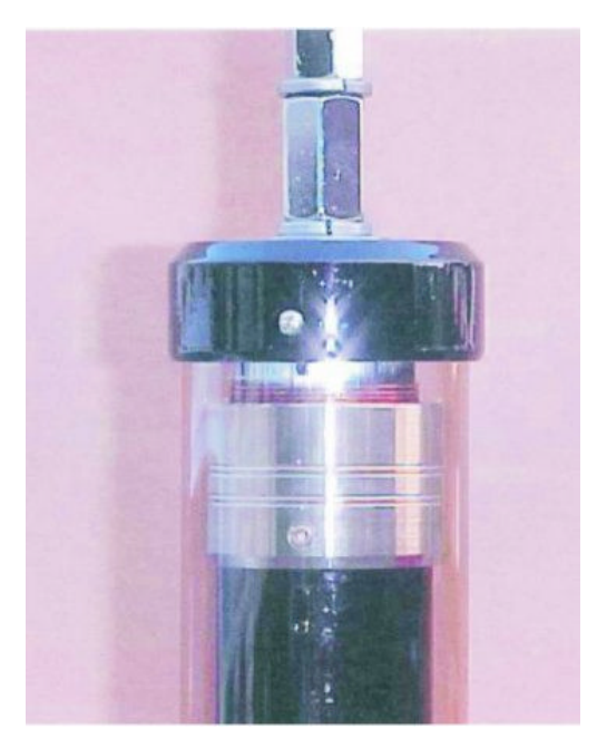
Little Tarheel II in 10 meter position with 32" whip