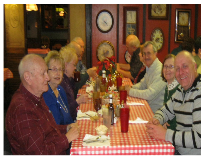
Christmas Party Attendees