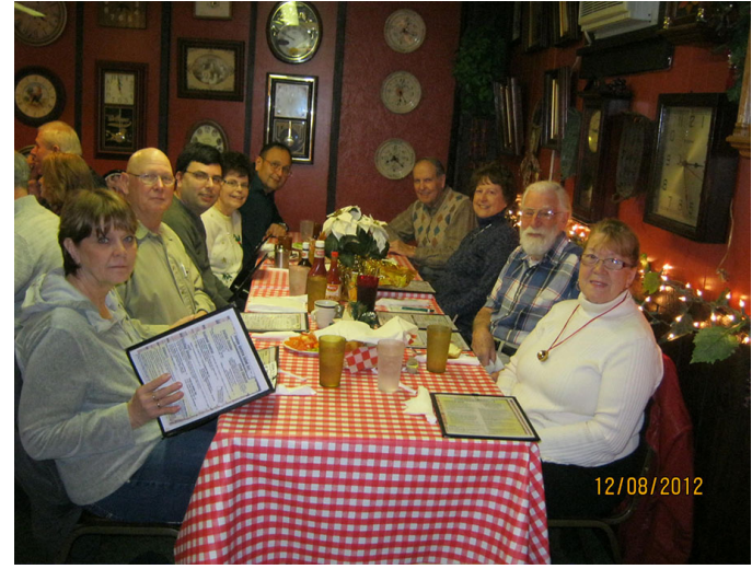
Christmas Party Attendees