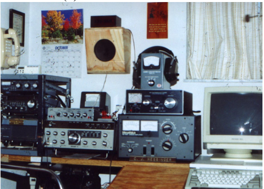
This is a picture of Cecil's current shack