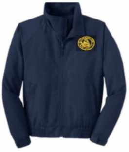
Dri Duck Torrent Waterproof Jacket