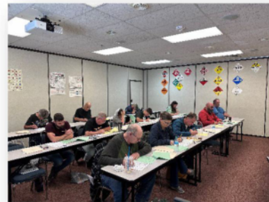
Figure 2 RRC In Person Technical Training Class October 2024

The Reading Radio Club (RRC) is committed to helping amateur radio enthusiasts advance in the hobby. In the recent past, we have provided free in-person and online Technician training classes , with plans to expand training for General and Extra exams. Plus, our fast, convenient online exam process makes upgrading easier than ever.