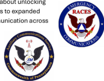
Figure 1 RACES and ARES Emergency Communications Logos

Upgrading your amateur radio license isn't just about passing a test—it's about unlocking new opportunities within the hobby! Each license upgrade grants access to expanded frequencies (especially in the HF band) and exciting new modes of communication across the bands. It also enhances your ability to operate on teams such as Emergency Communication teams that support the community (and the world) during emergencies or Volunteer Examiner (VE) teams that administer amateur radio exams.