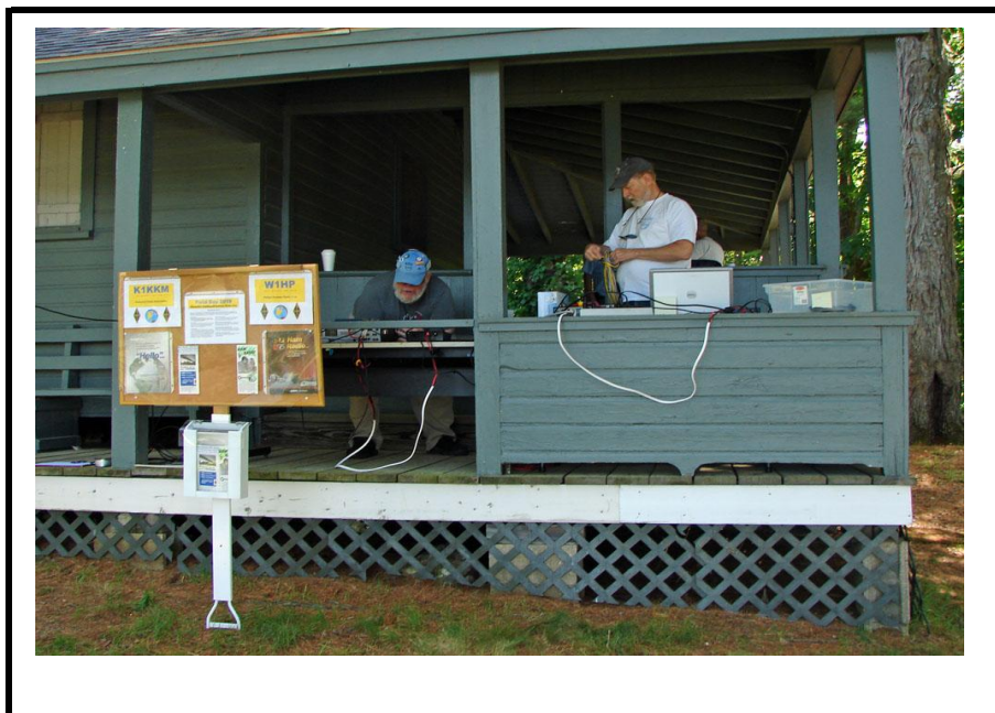
W1HP Information Center