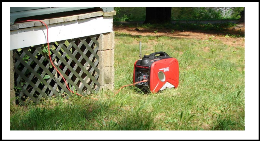
KD1NA Predator 2000