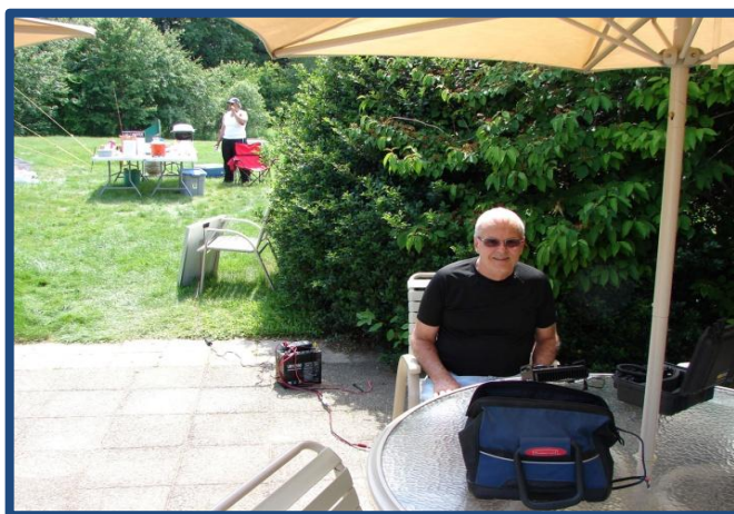
KD1NA running W1HP Natural Power Qs