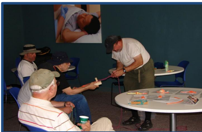
WB8WGY instructing us in knot tying