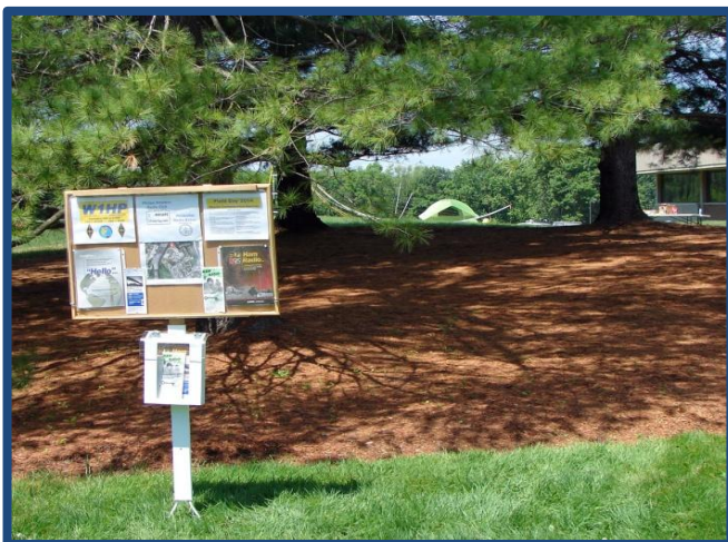
W1HP Information Center

Media Publicity na 0 Set-up in Public Place na 0 Information Booth Yes 100