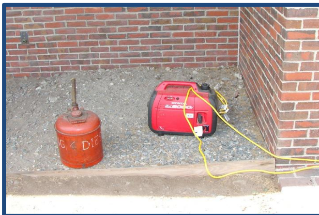
W1HP Honda-2000 Genertor