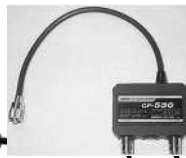
Comet CF-530C Duplexer 1.3-90 MHz 125-470 MHz