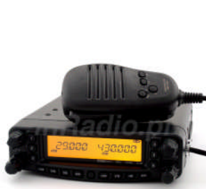
Yaesu FT8900 10m/6m/2m/70cm (8a @ 50/35w)