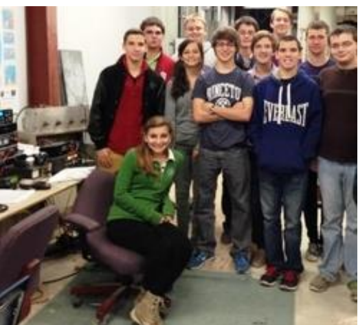
School Club Roundup has become one of the highlights of the academic year for students in the Bloomington High School Amateur Radio Club, K9SOU, in Bloomington, Indiana.

Anyone who participates can submit a log, even individuals sitting at home. WGD is fortunate to have several schools participating in this bi- annual event. Remember that most school stations are barefoot and have modest antenna systems. If a school is on a net frequency, let them know a few minutes ahead of time. Let them know about the net and see if something (most will accommodate) can be worked out, regardless, make sure you give them a contact and encourage your net members to do the same. Please, please, help those school clubs out if you can. You may not be "cool" to your kids or grandkids, but undoubtedly you will be "super cool" to someone else's.