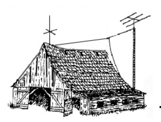
FEBRUARY 17, 2014 No.386