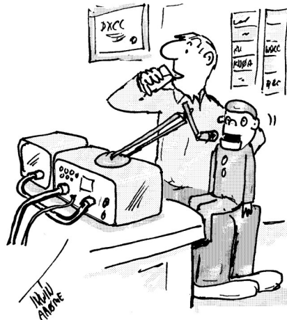
'At first, my mike fright was difficult to overcome... but where there's a will, there's a way.'