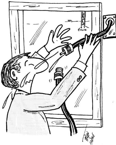
Until he unscrewed the barrel connector, Tom had scoffed at obscure reports of water traveling down through coax cables.