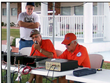
Let the Contest Begin!!