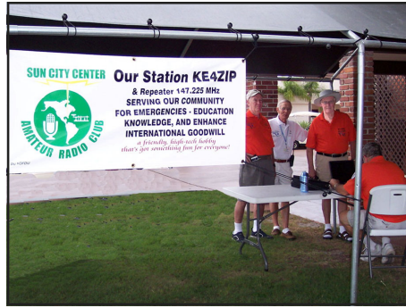
The club banner was on display.....