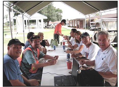
.... Which was quickly gobbled down!