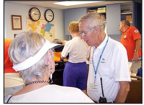
... which attracted a lot of visitors to the club-house!