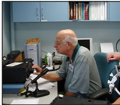
Everyone got a chance at the radios!