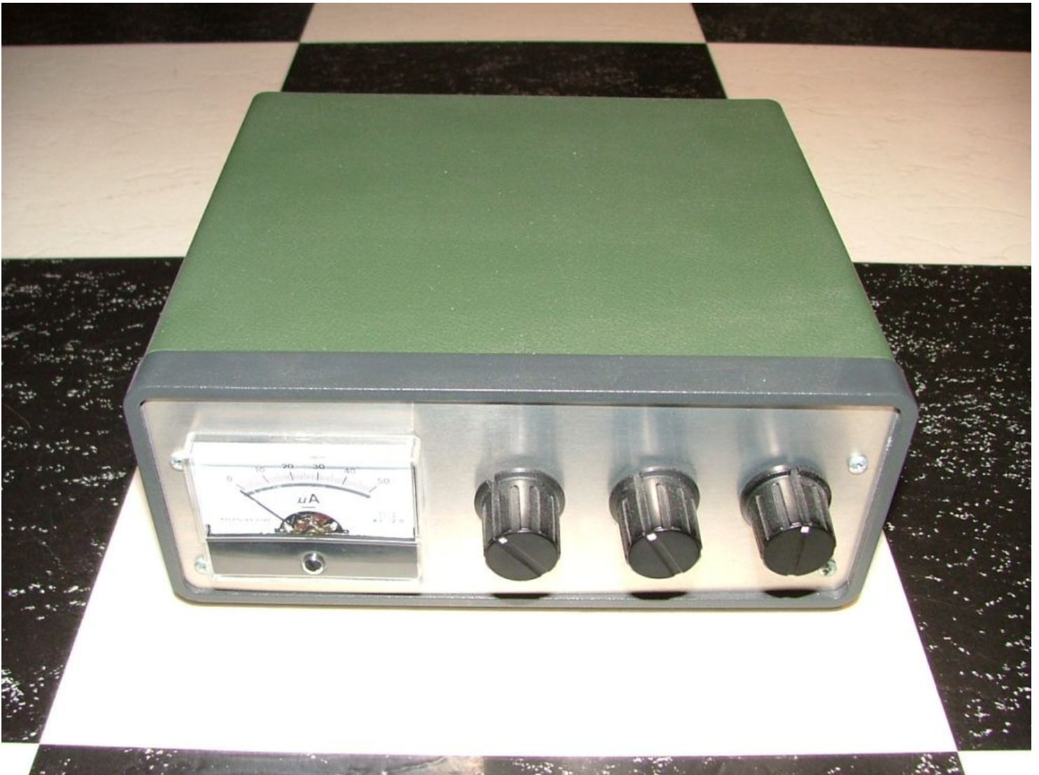
Frontside of the Artificial Ground device