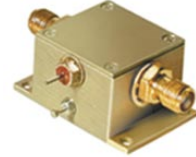
CASE STYLE: EEE132