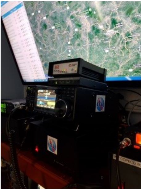
RMS node HR0COP in operation