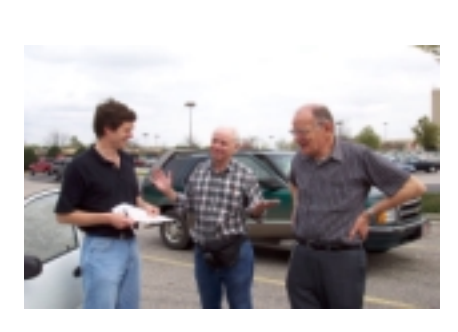
Figure 1- What, no hints?