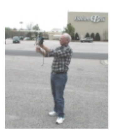
Figure 3 Testing....Testing