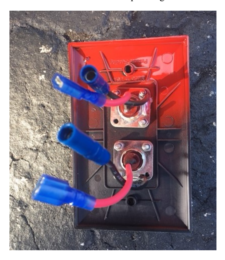
Figure 3. The second faceplate of one school's pass through system.

The other face plate has insulated, stranded wires, going to female connectors – a female spade receptacle and a female bullet connector. There may be a bit of dielectric grease inside the female connectors, which is intended to assist in weatherproofing.