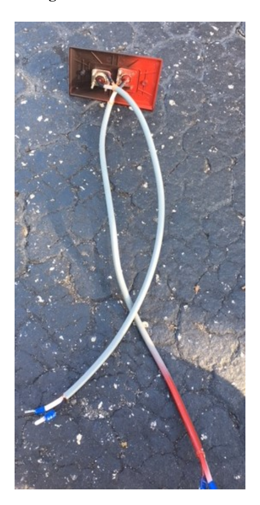
Figure Two: Nylon face plate with top end marked RED and top cable marked with RED paint.

CAUTION: The inner conductor of the RG-8X coax is solid #18 wire and does not bend well. Be cautious in applying significant force to the soldered connection to the SO-239 connector to avoid fracturing this insulated wire where it exits the cable.