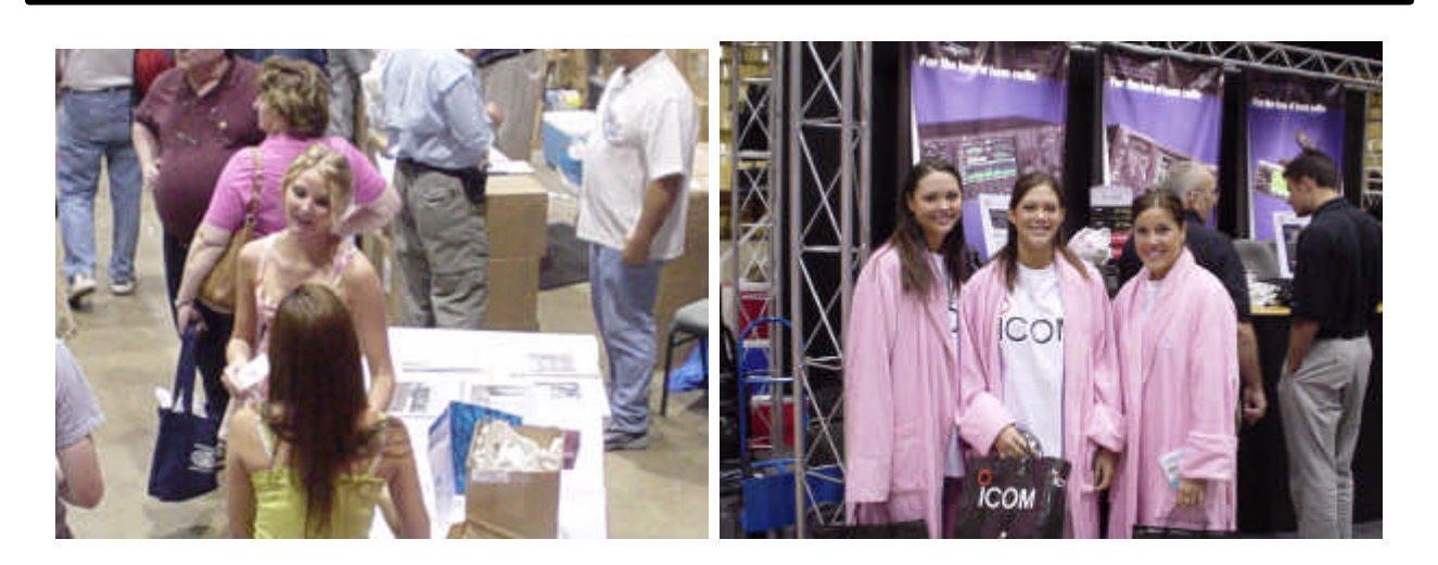
Selling Towers with a pretty face The "ICOM PJ Girls"

THIS IS (your call) NET CONTROL FOR THE LIVINGSTON AMATEUR RADIO KLUB NET. I WOULD LIKE TO THANK ALL OF THE STATIONS ON FREQUENCY FOR THEIR PARTICIPATION, AND I'M SECURING THIS NET SESSION AT (current local time). 73'S EVERYONE.