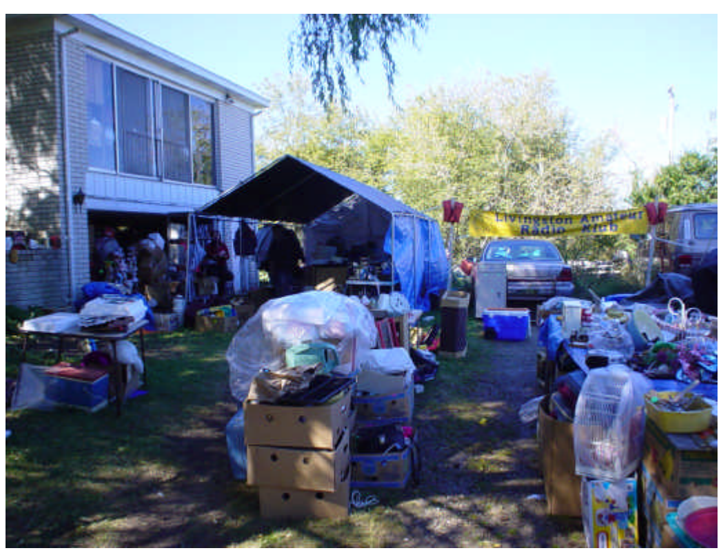
The Yard Sale That Is Playing a Large Part in Funding Our New Repeater