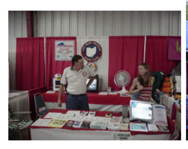
Van Wert Radio Club at the Fair