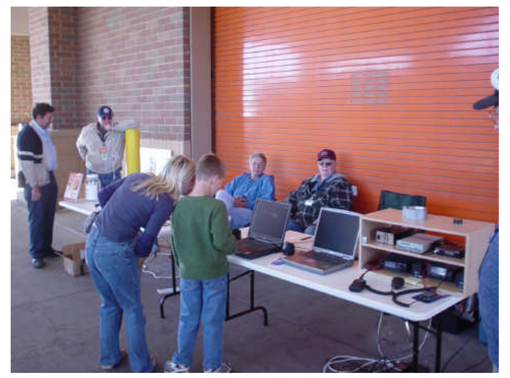
Amateur Radio at Home Depot