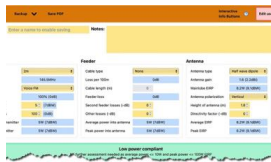
EMF CALCULATOR APRIL 6TH 19:30