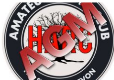
AGM 4TH MAY 19:30