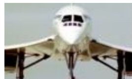
AMATEUR RADIO TO CONCORDE 1ST JUNE 19:30