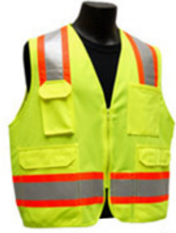
flap closures on both bottom pockets