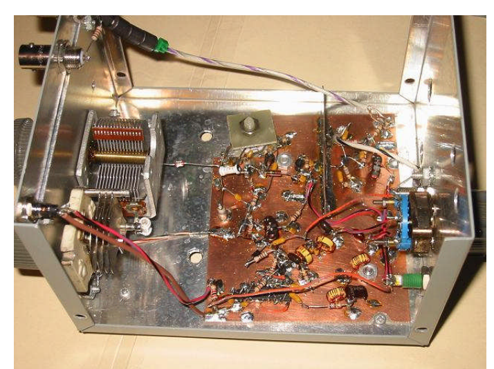
Fig 3. Inside view of the signal source, ugly to the core. The band switch is on the rear panel, something of an operational difficulty, although one easily fixed.