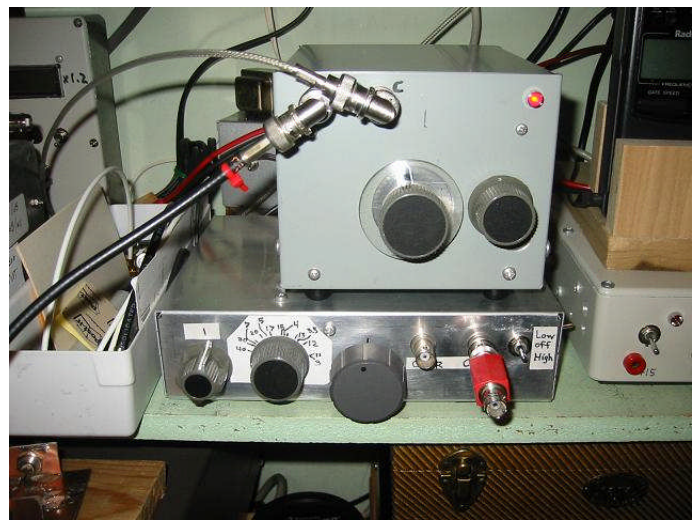
Fig 2. The upper gray box is an exterior view of the 8640-Jr. The lower box with three knobs is the RF source of fig 7.27, p 7.15 of <u>Experimental Methods in RF</u> <u>Design</u> (ARRL, 2003.)

Photos of the rf source are shown below.