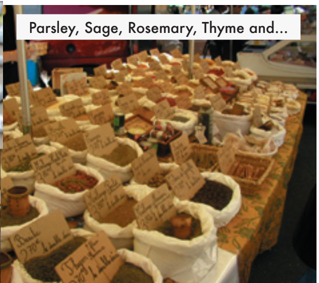
Parsley, Sage, Rosemary, Thyme and...