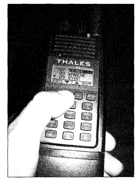
On the Thales/Racal25, accessing the unit ID list to make an individual call is as simple as pressing and holding the pound (#) key.

Just about every P25 repeater can be configured for mixed mode operation, and repeat both analog and digital signals.