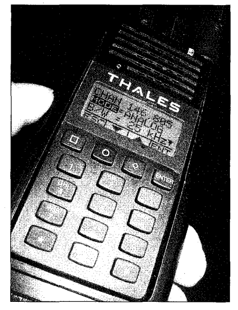
The Thales 25 (formerly Racal 25) is a P25 digital radio covering the 136-174 MHz band. Notice that this one has been reprogrammed for use on the 2-meter ham band. It features a very intuitive user interface, which allows channel parameters to be quickly programmed or changed from the front panel.

With P25, voice and data share the same channel seamlessly and simultane-