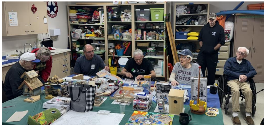
Veterans at the Ham Radio presentation at the Jacobetti Center.