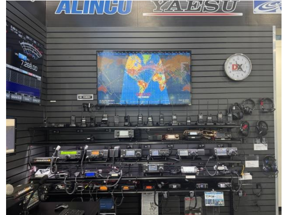
A nice display of equipment at DX Engineering.