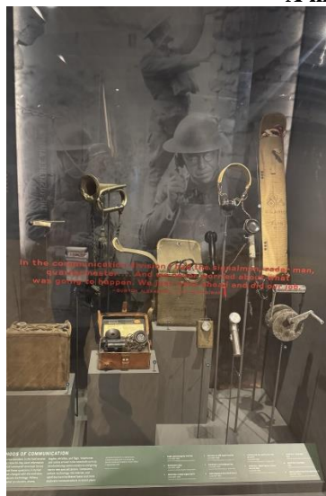
A display of WWI communications equipment at the National Veterans Museum in Columbus, OH.