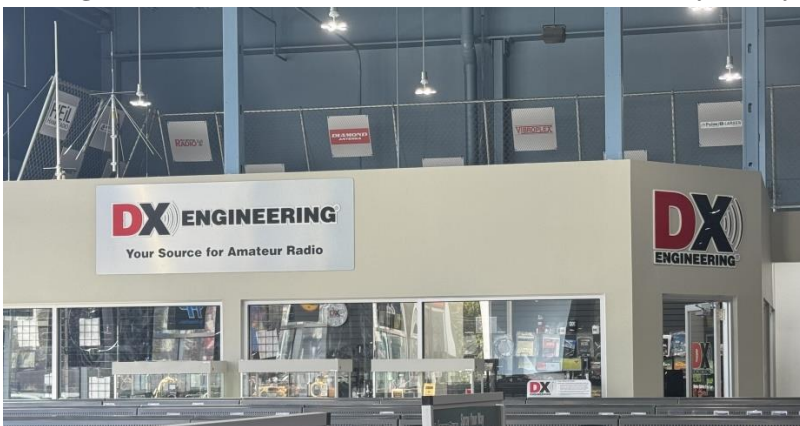
The DX Engineering store in Tallmadge, Ohio