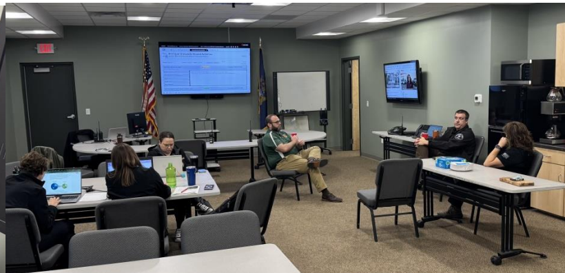
The Marquette Co. EOC. Our radio room doorway is to the right in the rear of the photo.