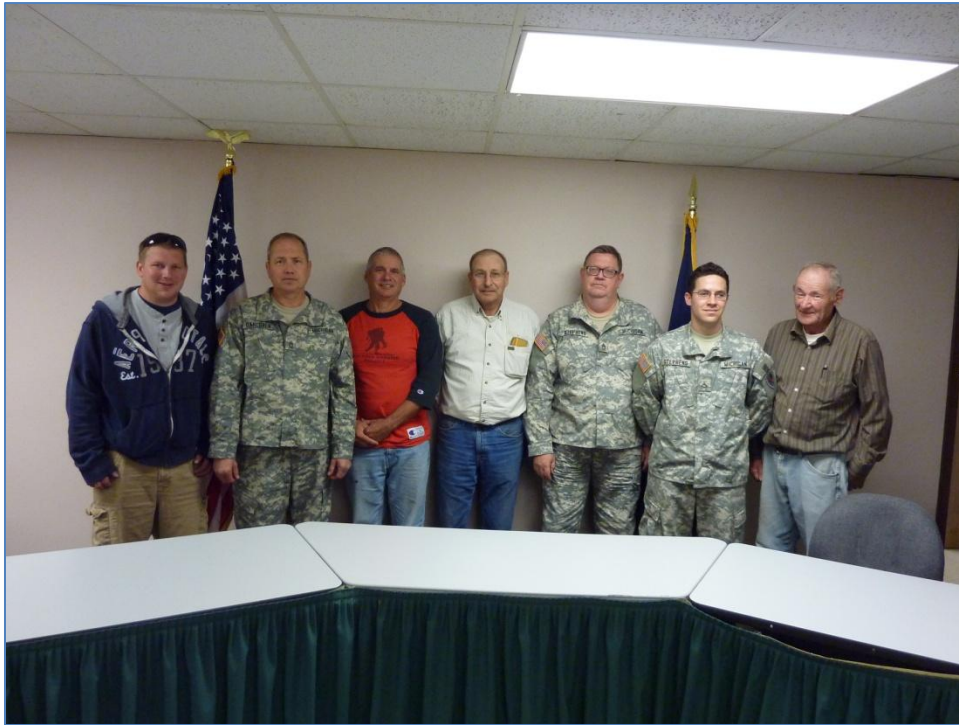
2013 Tech Class for Amateur Radio, Munising, MI October 5, 2013: VE Test Day Left to Right