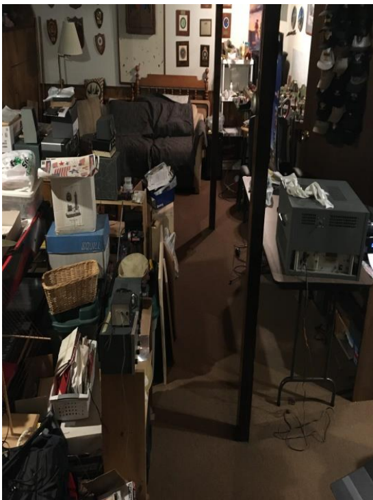
Yard Sale anyone!