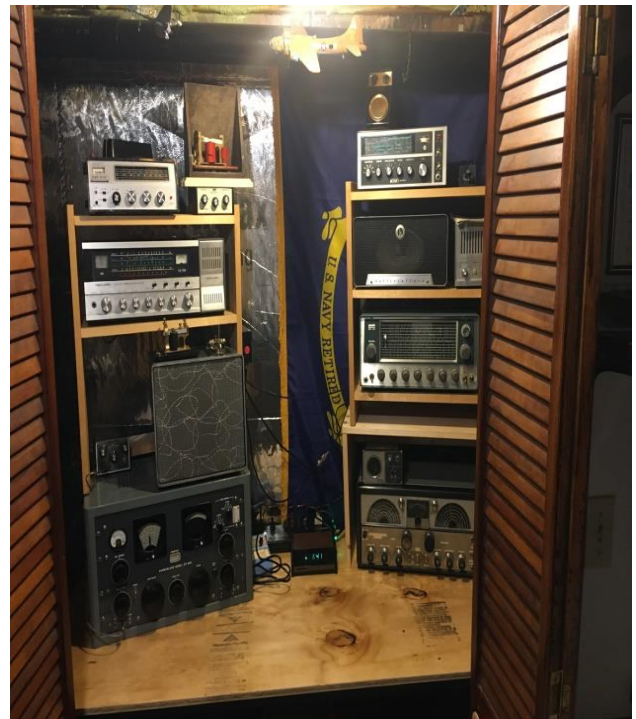
Finished renovation (no leaning)!