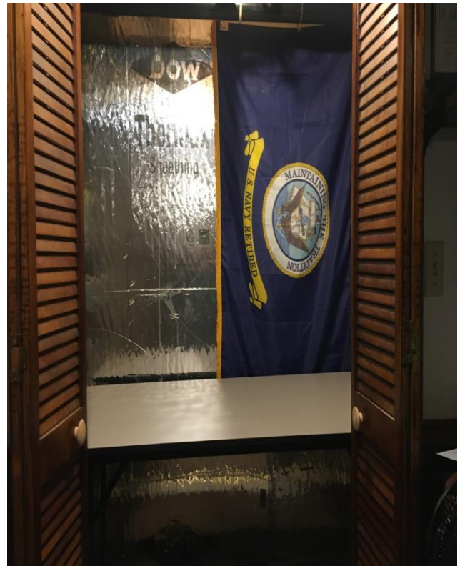
Empty closet with new – longer – table