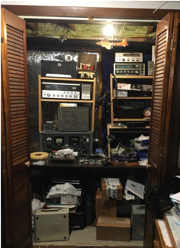
Closet BEFORE cleaning (note the equipment leaning toward the center)