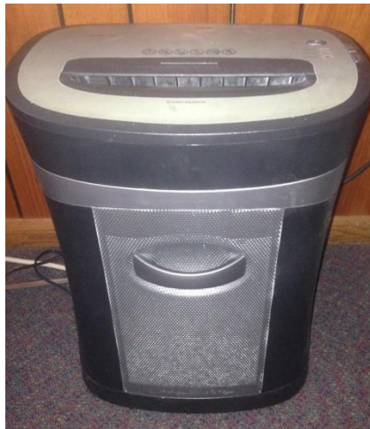
Jim’s “magic” shredder

Well, I moved the shredder to a different wall outlet and now the Mystery is solved!! But I still don’t understand how this actually happened.