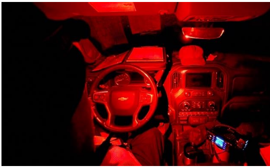
Night Shift Mobile